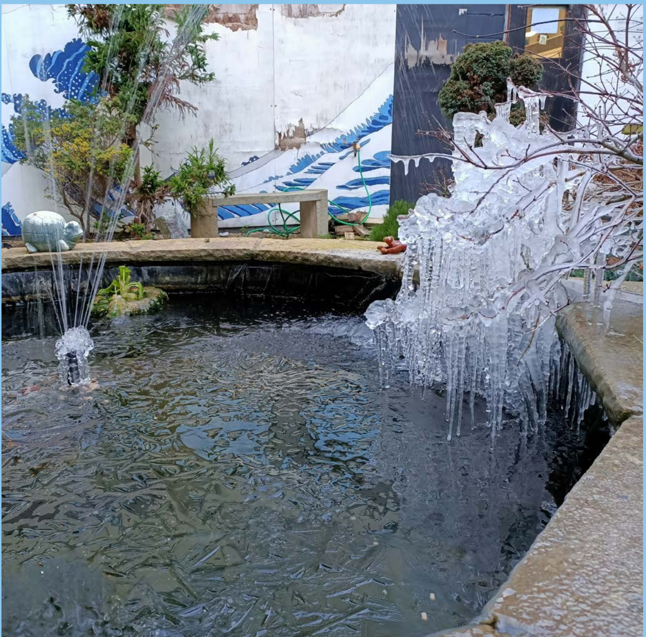
The Zen Garden in Darwin Block.