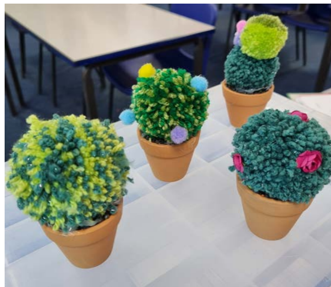
Woolen cacti plants made at Craft Club.